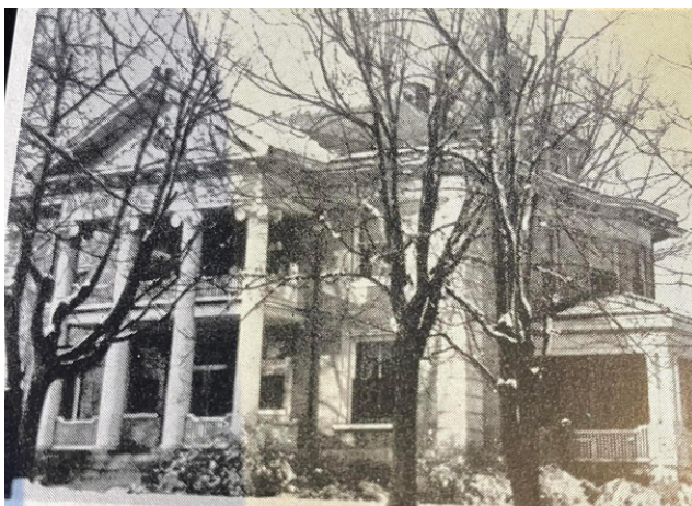
First Sig Tau chapter house at SEMO